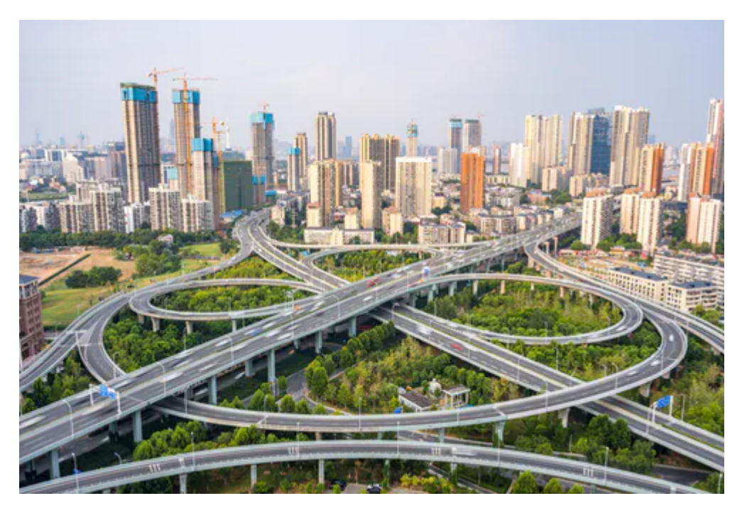
The COVID-19 outbreak began in a market at the edge of Wuhan, China.